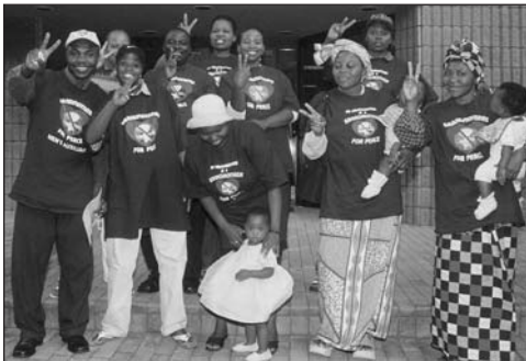
“The Grandmothers for Peace, South Africa Chapter-team, greet all of you with joy and peace on their lips!”

We are and will continue to work for the establishment of peace in this country. We deserve a world built on peace and respect for human rights – a world where people live in honor and dignity, a gun-free zone!